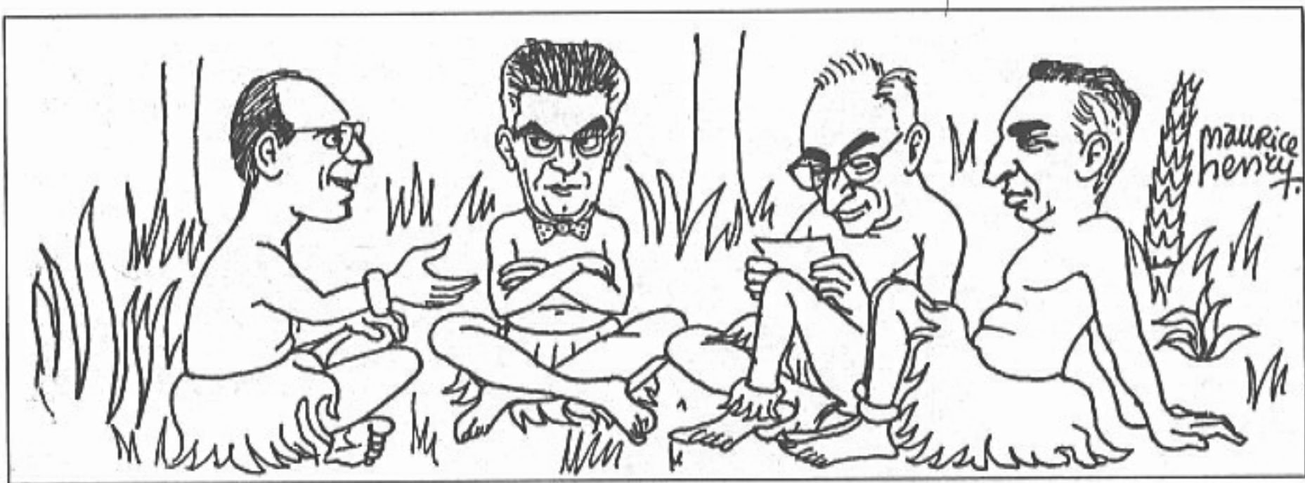
Cartoon by Maurice Henry, published in La Quinzaine Littéraire, 1 July 1967.