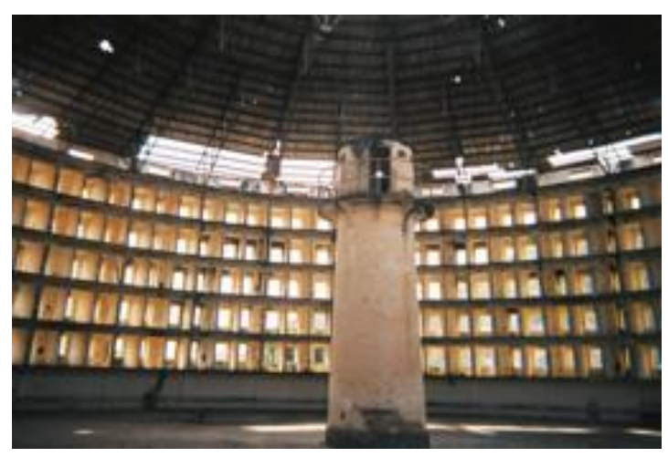
Panopticon plan and prison built after Panopticon model on Isla de la Juventud, Cuba, 1926