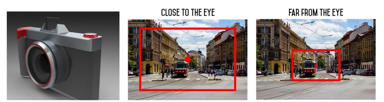
Figure 5. Future digital compact camera concept with two possible views through the new rangefinder; an overview when the camera is held close to the eye and a detailed cut-out of the scene when the camera is held far off (Deinum & Feij, 2017)

Based on this analysis, two major use aspects where included in the requirements for the future camera concept: "If possible, the camera should communicate openness to people around the user", and "While using the camera, the attention of the user should not lie with the camera, but with the subject." (Deinum & Feij, 2017, p. 47). The students solved this by introducing a cleverly redesigned range finder, which serves as a window to the world (figure 5).