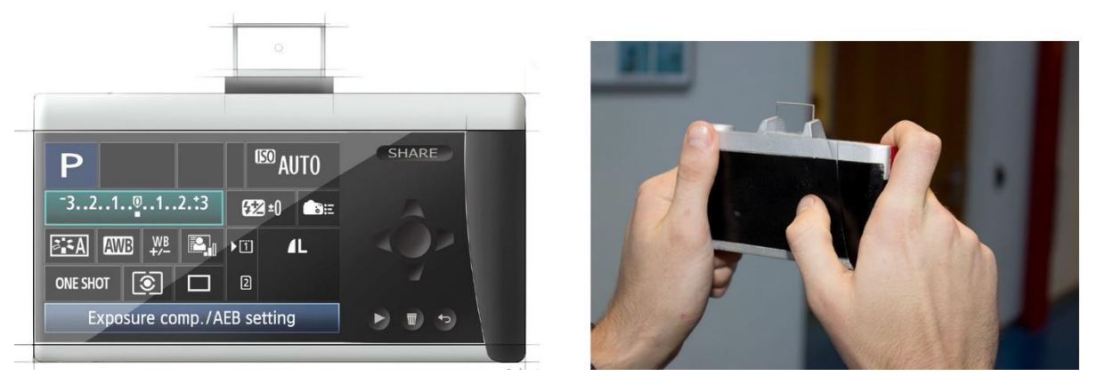
Figure 6. User interface of the future camera concept and a typical use situation holding the camera at a distance (Deinum & Feij, 2017).

conventional analogue cameras, because the open frame of the new rangefinder allows the user to see the whole environment. And from the perspective of the subject, the photographer is also more visible because the camera is held more at a distance (figure 6).