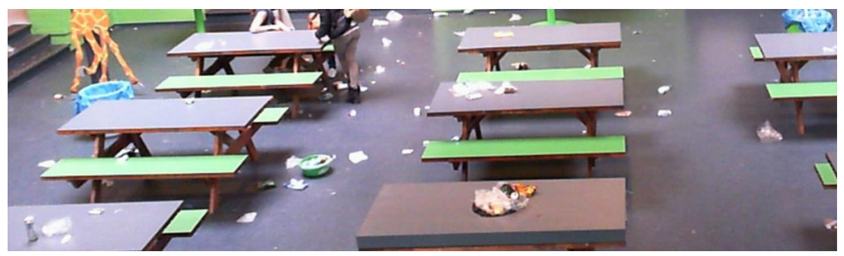
Figure 3. Image of the lunch area of the secondary school after one of the tests. The area around the converted table (in the front, with the bowl in the middle full of waste) is free from litter on the ground (de Waard, 2012).

Having seen this big difference in results from just slight differences in design solutions, de Waard chose to analyse the effects of his intervention with the Product Impact Tool. This tool presents the possible effects and affects in the interaction between users and technology, divided in four quadrants. These quadrants represent the physical "to-the-hand", the cognitive "before-the-eye", the environment "behind-the-back" and the abstract "above-the-head".